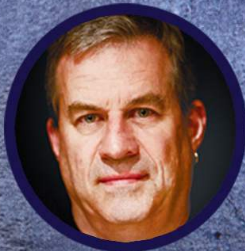
Sam Quinones Journalist Author of Dreamland